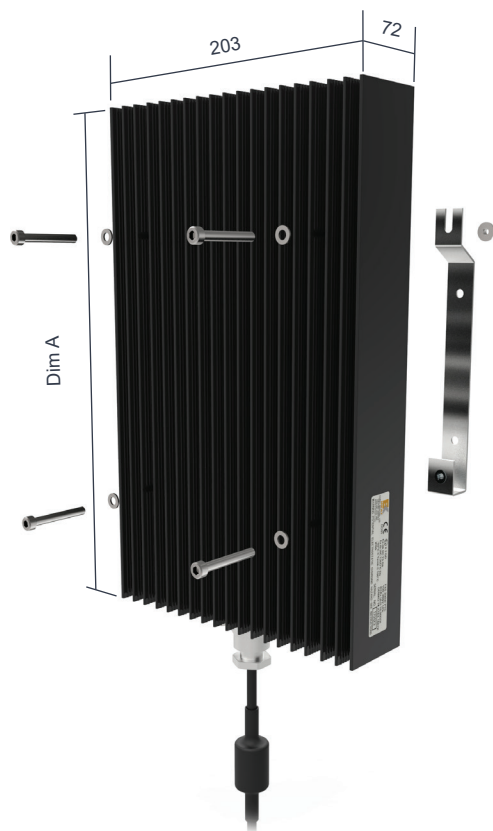
FXB-FD Fixed Duty Double-Finned Enclosure / Cabinet Heaters